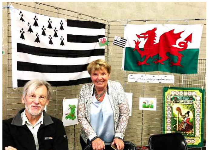
Fête des Associations Hennebont 2019

Town twinning – ‘jumelage’ in French – largely began after WWII to help rebuild good relations among national neighbours. Now, twinning is common across Europe, from cities to villages. Twinning is more than an official agreement or commemorative sign. Twinning associations allow residents to get involved. Events and activities include: socialising, school exchanges, sports, music and dance, holidays and tours, language learning, and formal delegations.