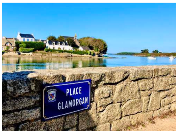
St-Cado's Island, near Hennebont

Hennebont is around 15km from Lorient, one of the largest fishing ports in France and famed for the annual Festival Interceltique. The region has historic Welsh connections. The 6 th century Welsh saint Cado, or Cadog, crossed the channel and is believed to have lived on an island in the Etel river, where a chapel commemorates him. More recently, Breton timber was traded for Welsh coal, which was brought up river to fuel Hennebont's industry.