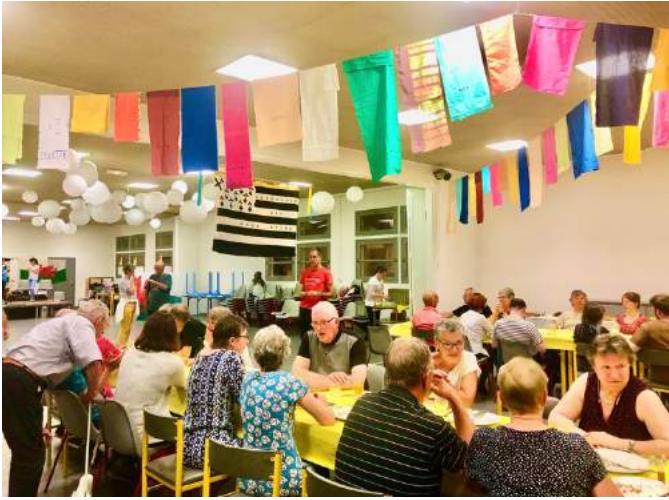
Dance exchange dinner, St-Brieuc