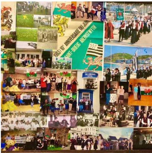
St-Brieuc – Aberystwyth twinning memories

Bryonny saw some spots where town twinning is commemorated in St-Brieuc – including the Aberystwyth roundabout! She visited the harbour and viewed the bay, learning about past stories and present challenges.