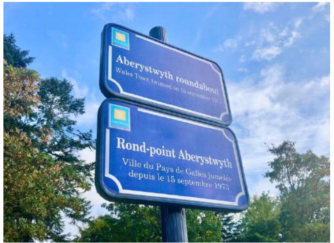
St-Brieuc's 'Aberystwyth Roundabout'

St-Brieuc is named for a Welsh saint – St Brioc, or Briog. He travelled from Ceredigion in the 5th century, and is known as one of the seven founding saints of Brittany. The town today is best known for its distinctive scallops – the coquilles St-Jacques.