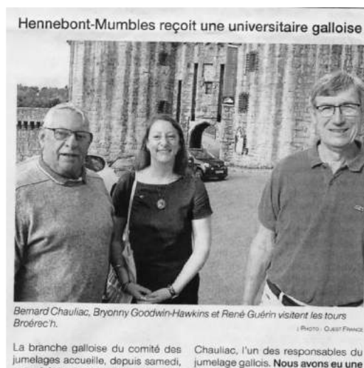
The Hennebont visit in newspaper Ouest France