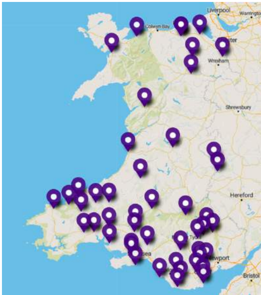
Twin towns in Wales © OpenStreetMap Contributors

Many Welsh towns are twinned with towns in Brittany. Twinning is part of civil society, providing opportunities for international friendship and cultural exchange. Welsh-Breton connections especially celebrate shared Celtic heritage. But, with challenges from budget holidays to Brexit, will town twinning stay relevant, or be relegated to the past?